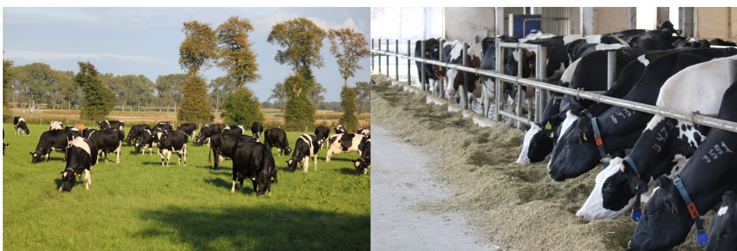
Dairy-cow feeding system during vegetation season - pasture grazing combined with conserved feeds

Thanks to the innovation the fodder resources from permanent grasslands can be fully used and there is obtained a sustainable milk production. "Half-day" pasture used in dairy cows feeding during vegetation season is beneficial due to the decrease of milk production costs and improvement of animal welfare and health. This model allows to produce milk of better quality in comparison to intensive systems which was confirmed by different tests and research.